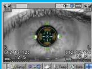
Auto alignment / auto shot

If you choose the multi shot option the system produces up to three air pulses in an extremely short sequence (0.1 seconds each).